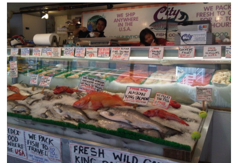
Home of the famous flying fish at Pikes Market Place.