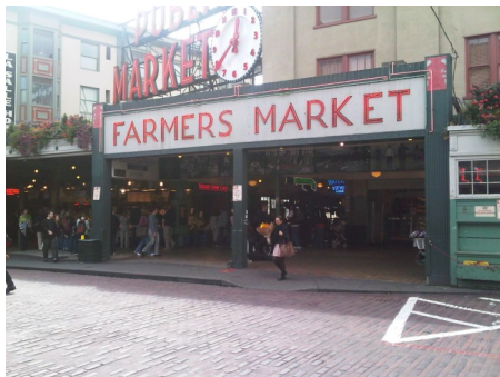
Pikes Market Place, Seattle

Leica Microsystems held their event on the top two floors of the Space Needle. The view was exceptional with a 360 0 view of Seattle. Everyone enjoyed the food and entertainment, and I must say that the desserts were “ to die for ”!